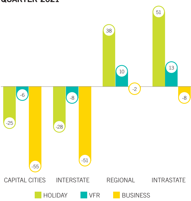
FIGURE 4: PER CENT CHANGE IN OVERNIGHT SPEND BY REASON FOR TRAVEL, MARCH QUARTER 2021

Business travel recorded large losses in March quarter 2021, most notably in capital cities and for interstate travel. Overnight trips were down 49% in capital cities and 54% for interstate destinations and spend down a similar 55% and 51% respectively.