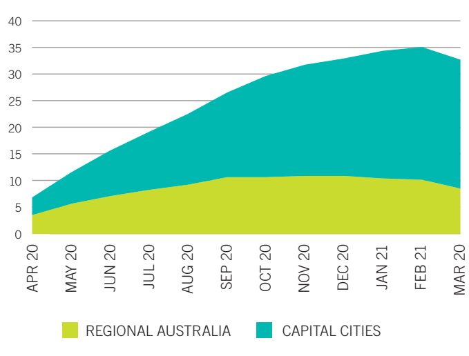
FIGURE 2: CUMULATIVE LOSSES IN DOMESTIC OVERNIGHT TRAVEL. YEAR ENDING MARCH 2021<sup>1</sup>

<sup>1</sup> The results of March 2020 were impacted by the start of the COVID-19 pandemic.