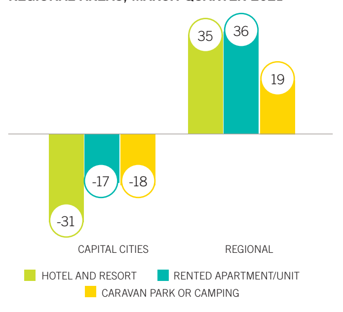
FIGURE 5: PER CENT CHANGE IN NIGHTS BY ACCOMMODATION TYPE, CAPITAL CITIES AND REGIONAL AREAS, MARCH QUARTER 2021

Rented apartments and units and caravan parks and commercial camping grounds fared particularly well in March quarter 2021. Nights were up 20% to 10.9 million for rented accommodation and 16% to 10.6 million for caravan and camping. However, as for hotel accommodation, results differed greatly across capital cities and regional areas (Figure 5).