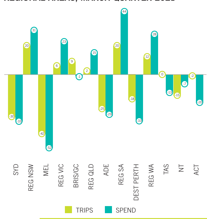
FIGURE 3: PER CENT CHANGE IN OVERNIGHT TRIPS AND SPEND TO CAPITAL CITIES AND REGIONAL AREAS, MARCH QUARTER 2021

Regional areas continued fo fare better than capital cities through March quarter 2021. Overnight trips to regional Australia were up 12% to 17.8 million and spend a greater 23% or $2.3 billion to $12.0 billion. The stronger growth in spend can be partially attributed to Australians taking longer regional trips on average (up 6% to 4.1 nights). In contrast, overnight trips to capital cities fell 18% to 7.9 million and spend a greater 28% or $2.3 billion to $5.9 billion.